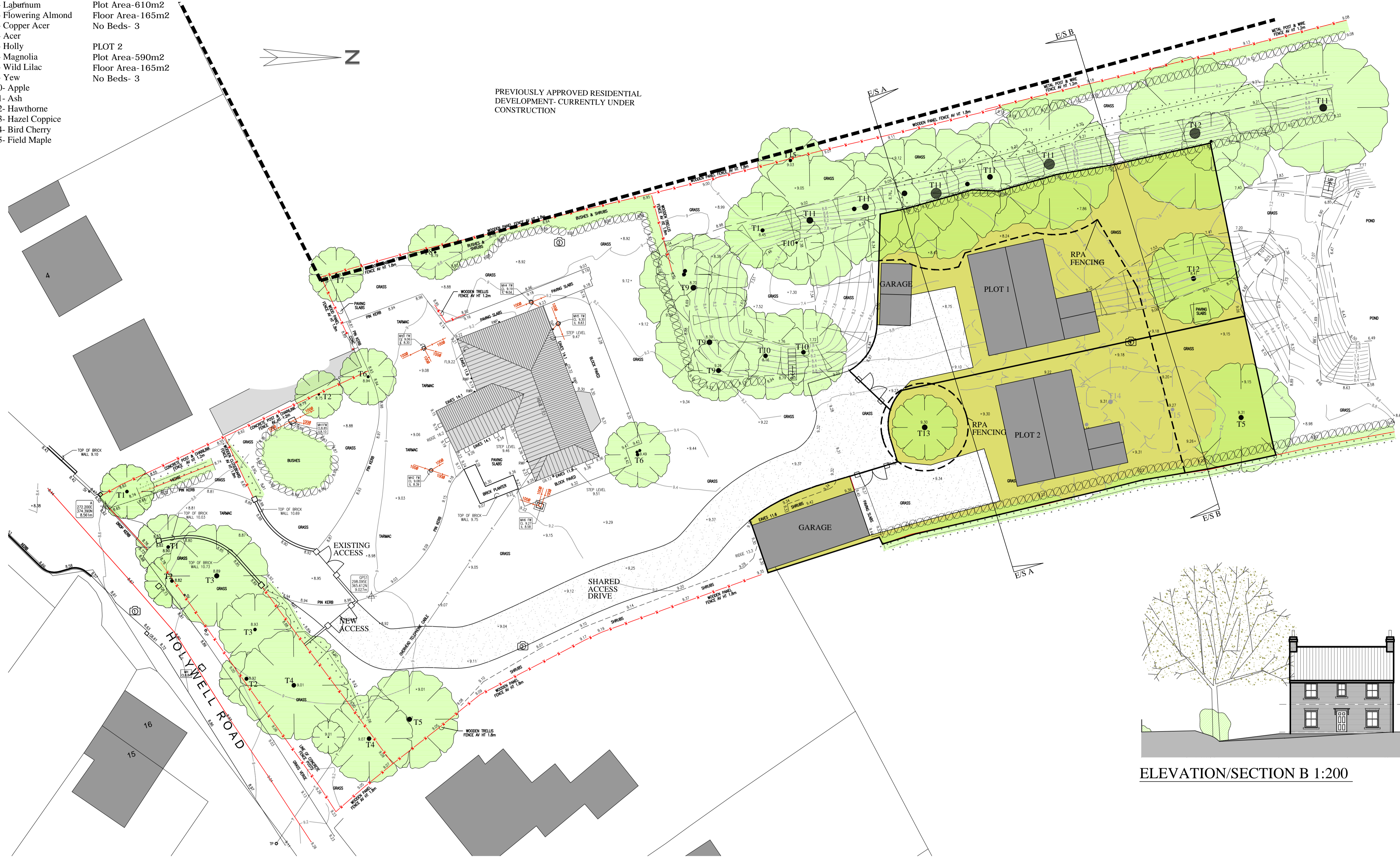
PROPOSED SITE PLAN 1:200