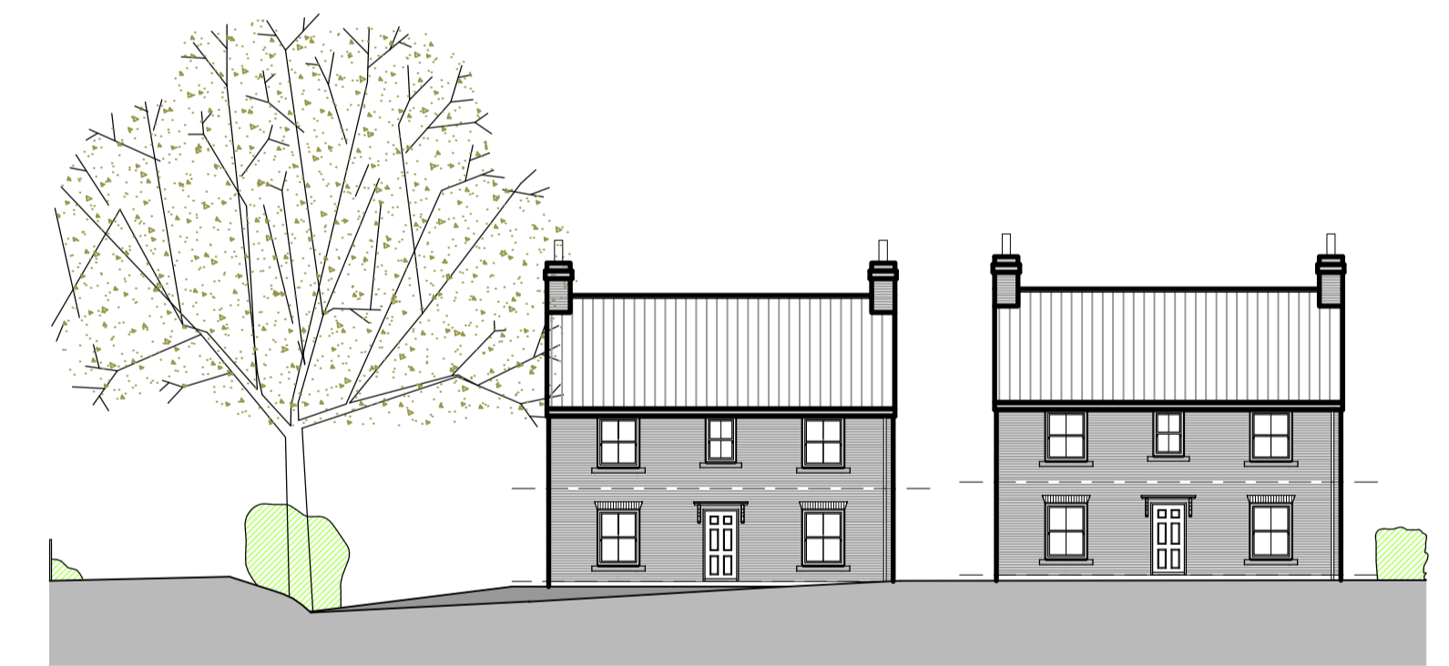
ELEVATION/SECTION B 1:200