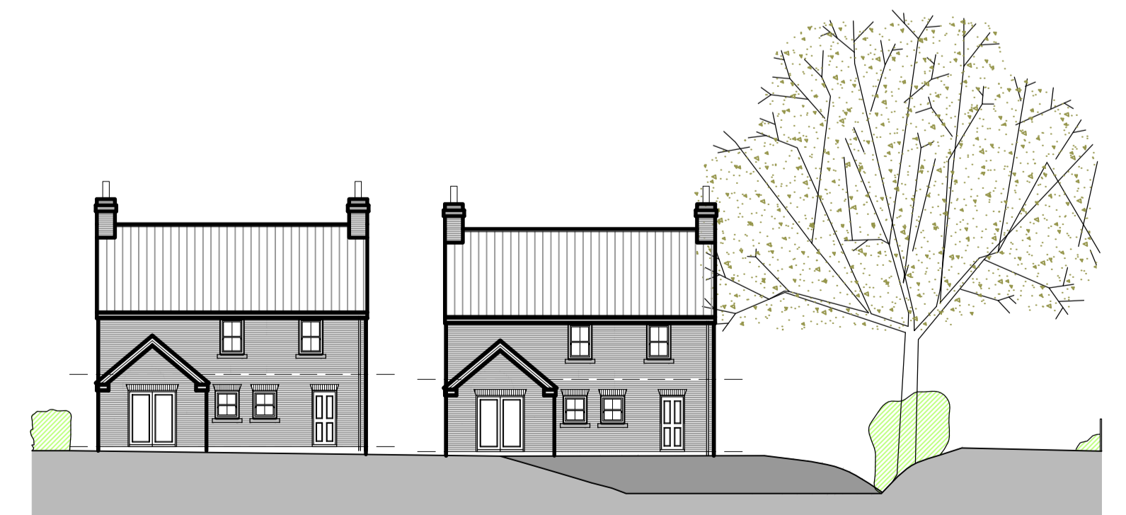
ELEVATION/SECTION B 1:200